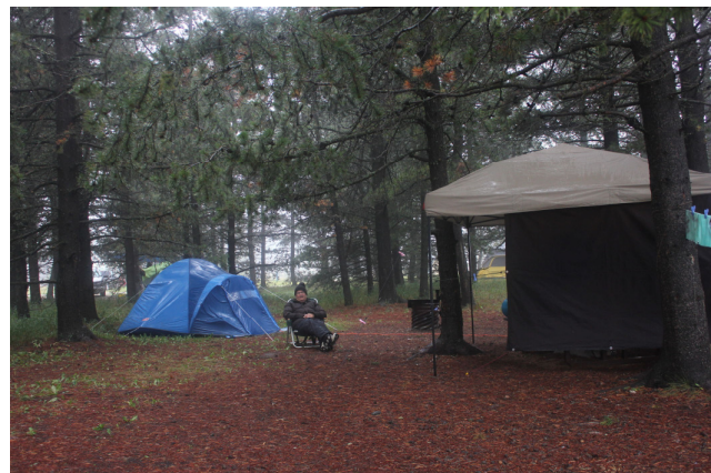
On Friday, in the midst of controlled chaos

It's easy to see that we clearly had three of the four items still in check. As MC for the event this year, I made the conscious decision to accentuate the positive and to not dwell on things over which we had no control, i.e. the weather. The people were great – complaints about the weather dissipated around Friday as everyone could see that clouds and rain were there to stay. They made do by attending the indoor barbecue on Thursday and all the sessions offered on Thursday and Friday evening and all day Saturday.