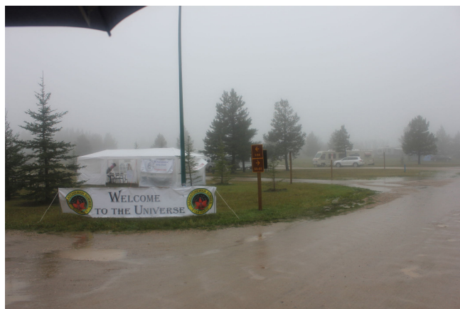
Friday arrivals are greeted to this scene