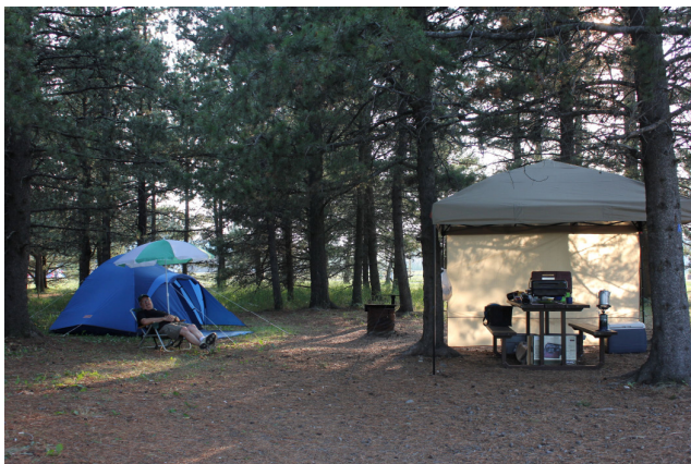
The author – on Tuesday before the rain hit