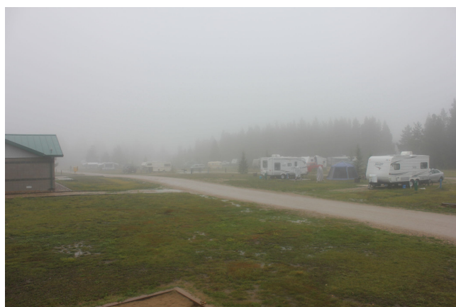
The meadows through early morning fog

Our SSSP continues to be successful also because of the volunteer efforts of our members. Yes there are key people from the committee who work tirelessly all weekend to make it a success but even non-committee members lend a hand. It is because of these efforts that our Star Party continues to be one of the shining lights among Star Parties across Canada (even when it rains)