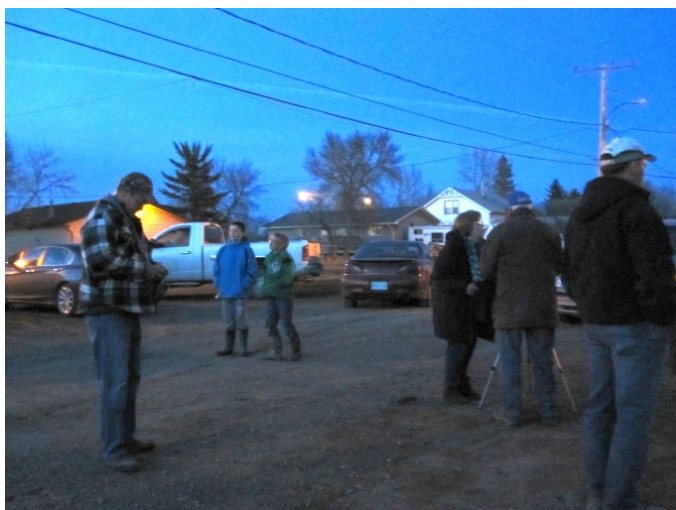
Picture Above - third telescope. A lady had bought a goto telescope and brought it to the library, and asked me how to use it. I could not help her for I had never been able to get one to work. She called the 90 year old gentleman from whom she had bought the telescope, and he came and showed her how to use it.