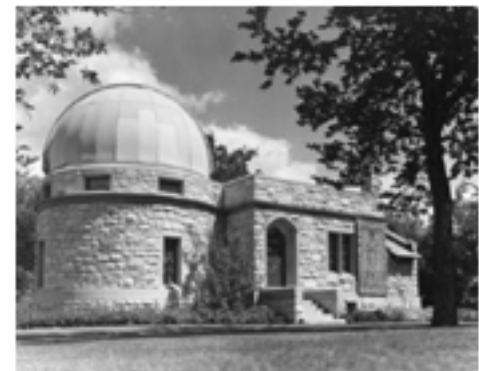
Observatory 1966 Smaller trees and bushes, old dome, and sundial intact

I am impressed with the professional quality of the current membership and I look forward to eventually, with your assistance, educating myself in astronomy enough to actively join their ranks.