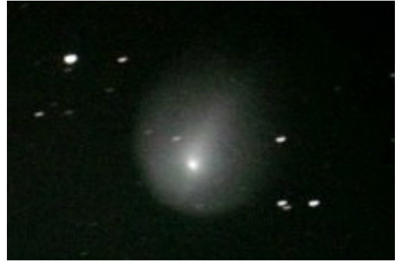
Comet C/2012 X1 (LINEAR)