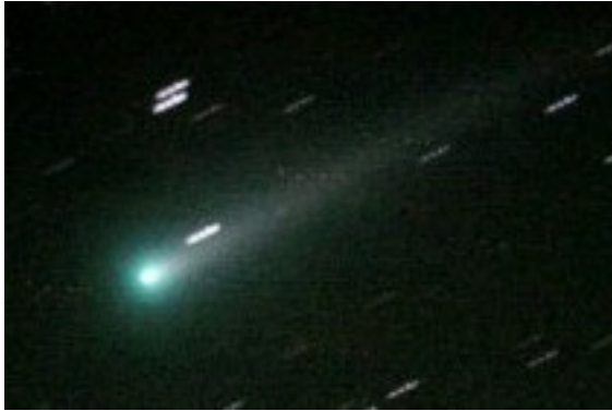
Comet C/2012 S1 (ISON)

Editor's Note: Details and more photos can be found on Tenho's website now, http://www.lex.sk.ca/astro/350d/2013.htm