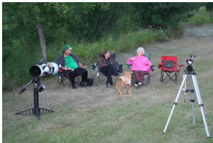
Figure 1: Danielson Park, photo courtesy Tenho Tuomi

For those of you unfamiliar with the Stargazer Train, it departs Ogema, Saskatchewan about sunset and returns roughly 3 hours later. It stops at Horizon, SK which is aptly named – there are 3 streetlights about 1km distant, and the horizons seem limitless except for the nearby heritage elevator – where the tour operators have laid out a square of red Christmas lights where patrons set out their lawn chairs. The train is heated which is a blessing on a crisp autumnal evening, because after an hour or so of viewing the painstakingly-refurbished Pullman car is a haven.