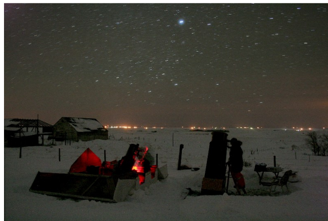
a two minute exposure taken with his Rebel XT

From time to time, I catch a meteor streaking through the southern sky, one a particularly long diamond line.