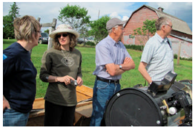
At the Tuomi Observatory Summer Solstice Star Party. SASKATOON SKIES JULY/AUGUST 2011