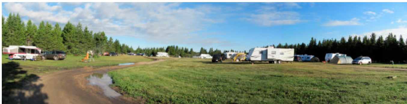
The Meadows, Saskatchewan Summer Star Party 2010, after the rain.

Note: There will be an Executive Meeting at 6:30 pm.