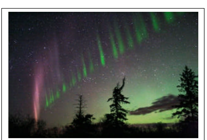
Unusual stationary aurora, April 5, 2010, 06:05 UT.

Saturday morning, April 24, we are at the Saskatoon Farmer's Market beginning at 8:00 am till roughly 2:00 pm. This location, as many of you know, has become a real destination spot for both city dwellers and visitors alike. We will have our display set up, and also some telescopes for solar viewing. Barb Wright is site captain for that event and will be looking for