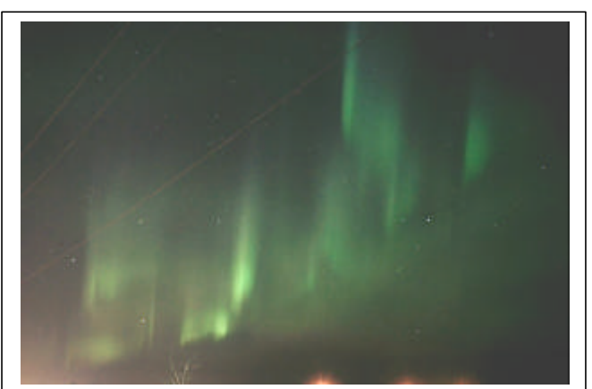
First good aurora in this sunspot cycle, on Monday night, April 5 between 9:30 and 10:30 pm.

If you live in the Saskatoon area, we hope you'll come and join us at these special events. Bring a telescope or binoculars to the public observing sessions and help show everyone the night sky. If you live farther afield, celebrate the day by doing some sidewalk astronomy in your own community, or just by getting out to your own favourite observing site with friends or family. Please send us some pictures afterwards.