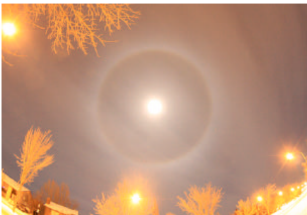
Lunar Halo through a fish-eye lens, Nov 11