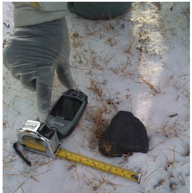
Closeup of a Buzzard Coulee meteorite