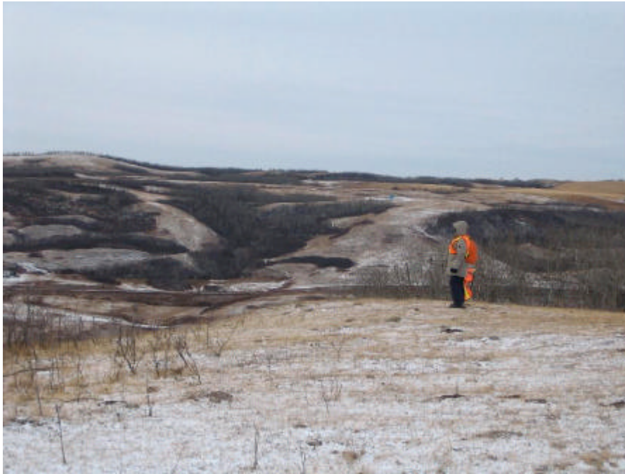
Gordon Sarty takes a break from meteorite hunting to take in the panoramic view above Buzzard Coulee