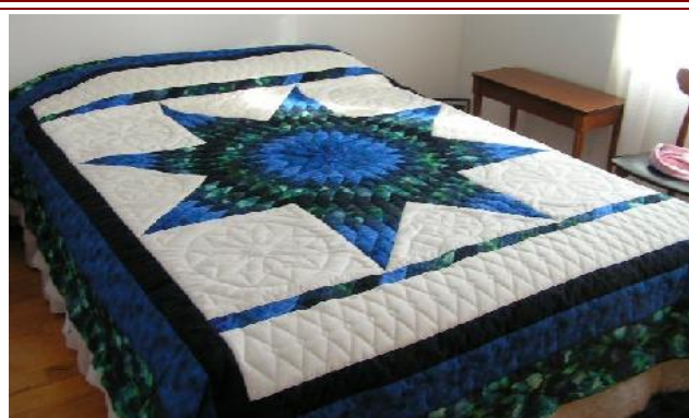
Many hours of hand work went into the making of this very fine looking quilt. Most of the work on the star was done on a treadle machine, for those of you who know about quilting. The side of this quilt is 85" x 101", which is large enough to fit a queen size bed! (value$2500)

http://www.astroleague.org/al/obsclubs/herschel/hers400.html