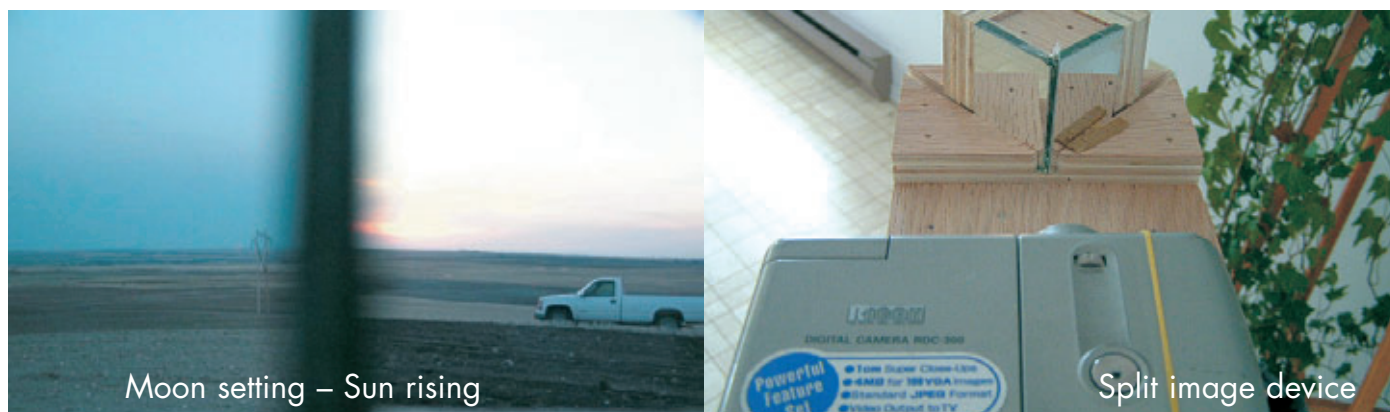
Moon setting – Sun rising

that are 180 degrees apart. At 5:30 AM I drove up on the local height of land, Swede Hill (or Cerro Suede...), about 2 miles northeast of my farm. The moon kept its part of the bargain, being clear to the horizon in the WSW but there was a small strip of cloud of about 2 degrees above the horizon in the ENE which unfortunately obscured the sunrise. However, in the shot I did get the moon right on the horizon and you can see where the sun would eventually peek above the clouds. It was worth a try anyway. Will try again on Oct 17, 2005.