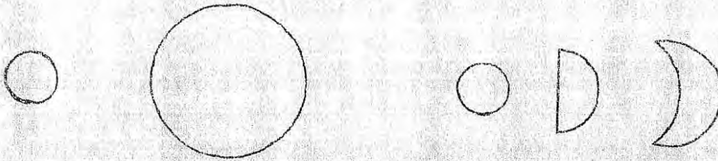
1. The Sun as seen from the Earth and Mercury.

In conclusion, I feel that the inner planets are interesting visual objects as far as the naked eye is concerned, but unrewarding through amateur telescopes.